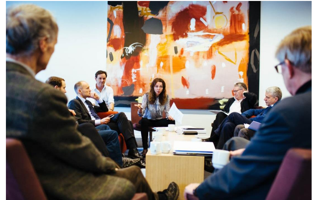
Kickoff-meeting, Snekkersten (DK), 18-19 February 2014